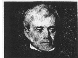
General Sylvanus Thayer 1785-1872

Just a short piece that might interest some of you. Many Thayers are descendent cousins of Gen. Sylvanus Thayer. He is, perhaps, one of the most famous of all Thayers, and he had many titles and honors bestowed on him during his lifetime.