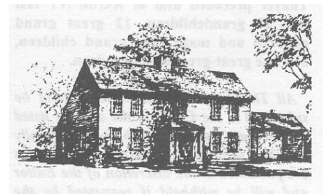
General Sylvanus Thayer House